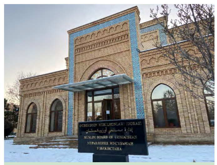
The Muslim Board of Uzbekistan, a successor to the Sovietera Muftiate, regulates the practice of Islam in the country, appointing and dismissing imams, overseeing the content of sermons, and determining what Islamic rituals and practices are acceptable

But the state's relationship with Islam changed little in comparison with the Soviet era. By 1992, the Soviet-era Spiritual Administration of Muslims was disbanded, and a Muslim regulatory board (Muftiate) was established in Uzbekistan and each Central Asian state. The Karimov government quickly came to regard independent Islamic practices as a threat, particularly based on Karimov's belief about the causes of the violence, civil war, and instability wracking neighboring Tajikistan and Afghanistan.