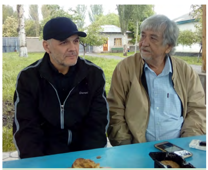
Human rights defender and expert on religious freedom Surat Ikramov (right) died on May 3, 2021. In September 2020 he met released religious prisoner and prominent cleric Rukhitdin Fakhritdinov following his release earlier in the month © Surat Ikramov, September 2020.

By 2010, a rare admission was made in the official Uzbek government report to the July 2014 by the Initiative Group of Independent Human Rights Defenders, led by the late rights activist Surat Ikramov, which estimated the total number of religious prisoners to be approximately 12,000, with more than 200 newly convicted in 2013 alone.