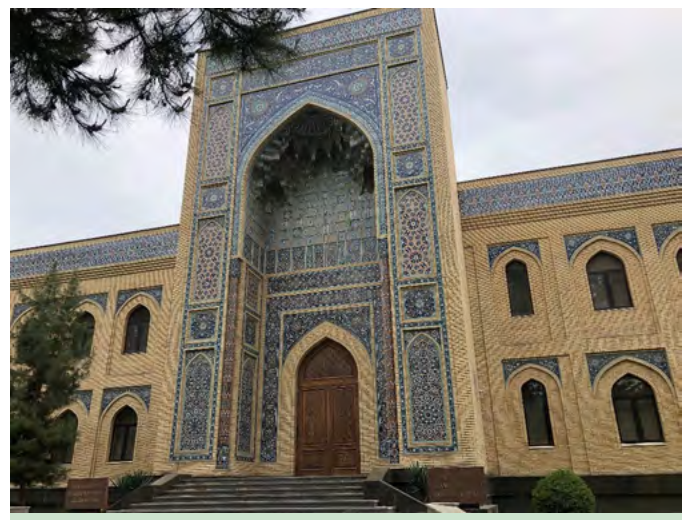
International Islamic Academy, Tashkent, Uzbekistan © Steve Swerdlow, October 2020.

Clear from the language used in official pardon announcements is a philosophy that religious prisoners are individuals who have been "misled" or "deceived" or are the "victims" of extremist groups, rather than of the government's vague and overbroad policy of religiously motivated imprisonment. These formulations only reinforce the finding that Uzbekistan imprisons peaceful members of banned groups who have not committed acts of violence. Indeed, Uzbek government policy is to release religious or political prisoners contingent on them admitting guilt, which in many cases may violate their religious beliefs and absolves the government of having to investigate past and present problems that led to their unlawful imprisonment in the first place. It is clear that the government must examine, with a view to immediate release, all cases where criminal liability is founded on membership in groups the Uzbek government considers "extremist" or "terrorist."